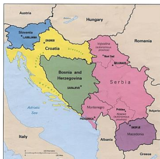
Figure 1. New Independent Countries in Former Yugoslav Federation Lands

Arriving West Balkans in 7 th Century, Croats established their kingdom in X. Century. However, Croatian territory was conquered first by Hungarians in 11 th Century and later in 16 th Century by Otoman Empire with the Mohacs War. Upon the failure of second siege of Vienna, Croats was conquered this time by Austro-Hungarian Empire. With the separation of Austro – Hungarian in World War I, Croats joined to Yugoslavian Kingdom. After the Nazi occupation in World War II, Croats, just like their neighbors, joined Yugoslavian Socialist Federation. In 1991, Croats declared their independence (Oliver, 2006: 140 – 144).